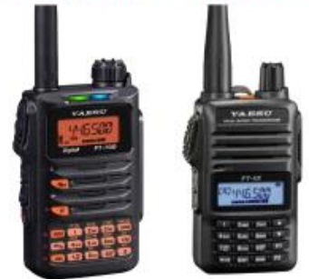
Yaesu FT-70DR & FT-65 w/ RTSystems Software