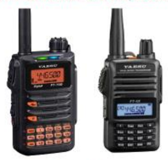
Yaesu FT-70DR & FT-65 w/RTSystems Software

Historic Loomis Train Depot 5775 Horseshoe Bar Rd, Loomis