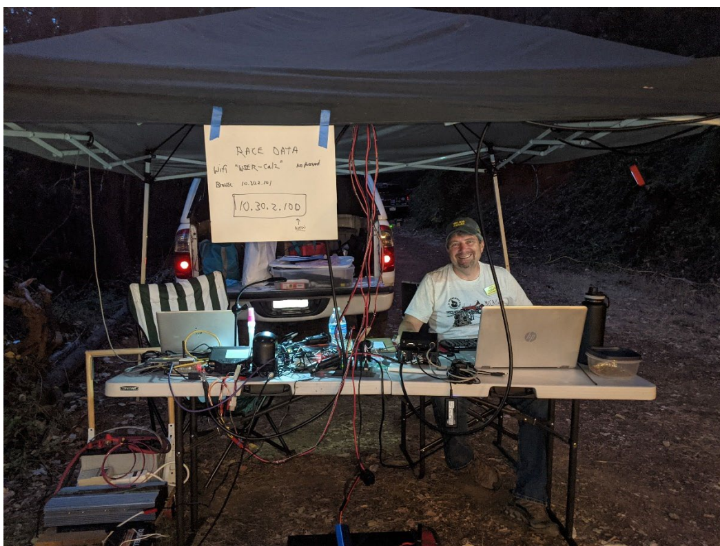
Orion, AI6JB at the Western States Aid Station