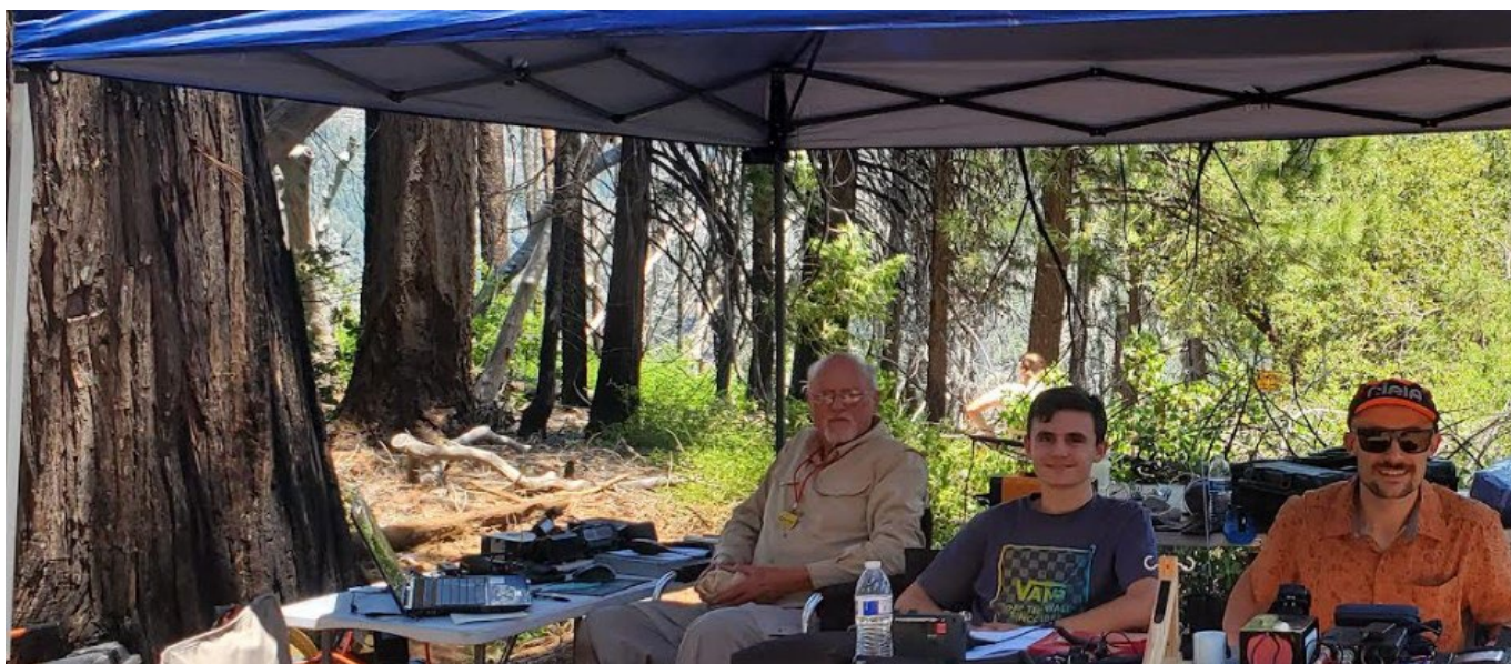
Devils Thumb - KK6YMJ, KN6JNR, KM6YVW at your service!