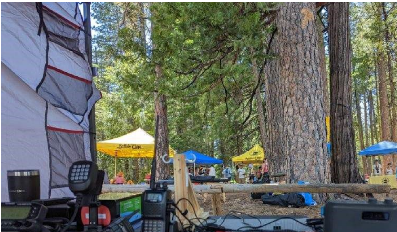
Devils Thumb Aid Station