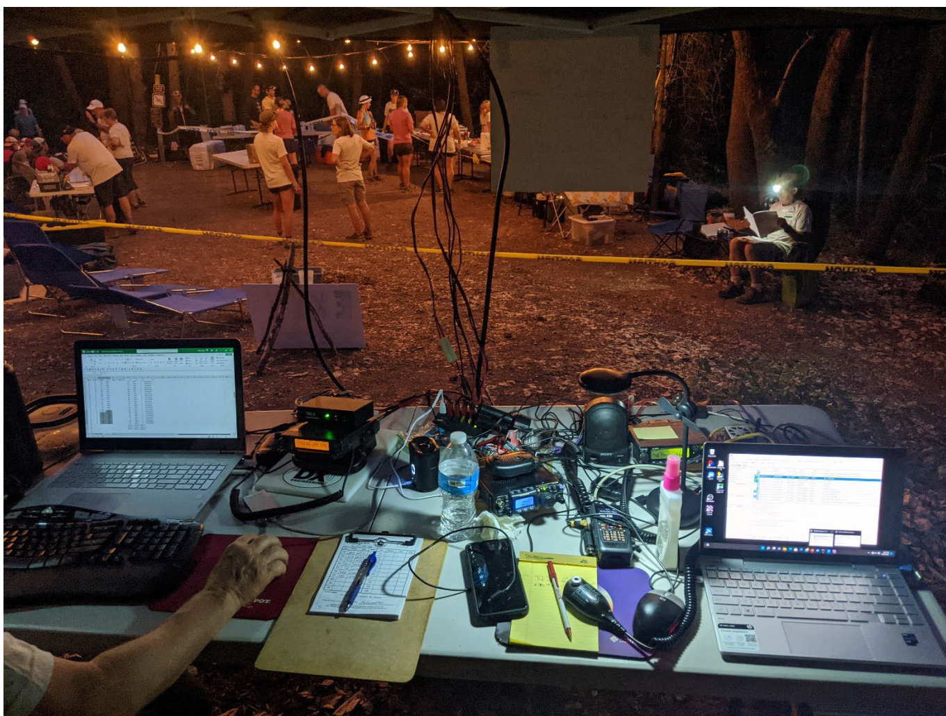
The view from the Aid Station

There are SO many more pictures available online. Please visit the W6EK Photo Gallery page for more. Click here to view photos.