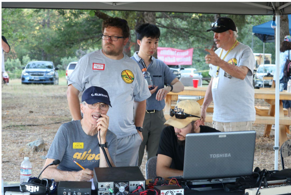
AJ6OR makin' contact – I wonder where this contact was?