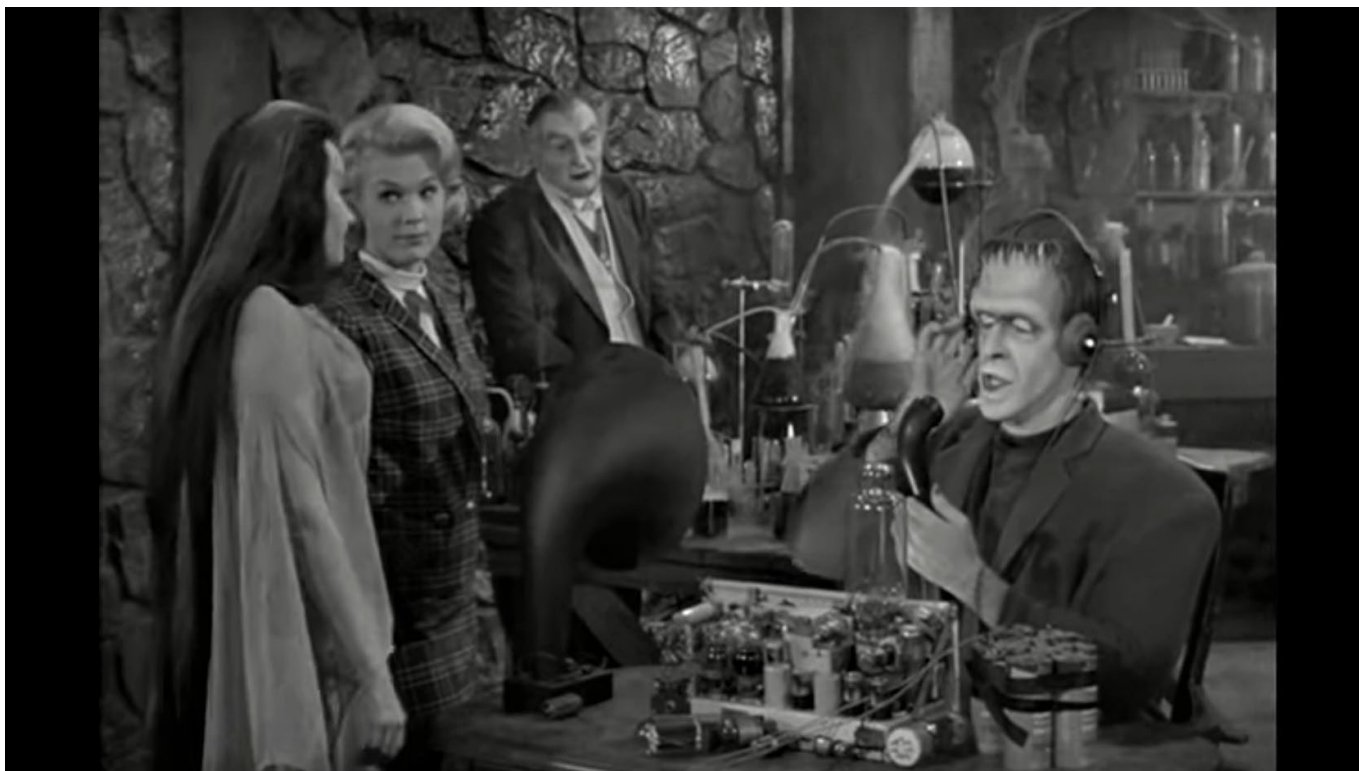
Herman Munster - W6XRL4 (fictitious)

RG (as in RG-213, RG-11, RG-8 coax) stands for: