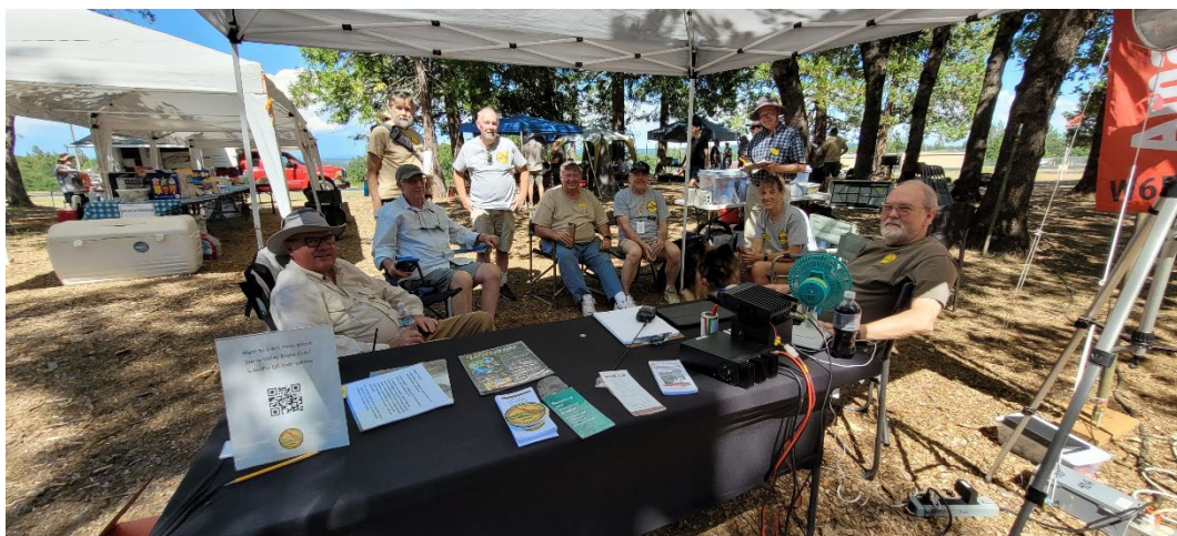
Welcome to the SFARC Field Day activities – ready for visitors.