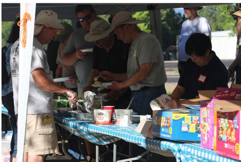
Grub Time! Feeding the fever, radio fever that is...