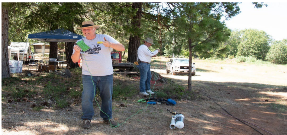
AJ6US ready to launch (the antenna)