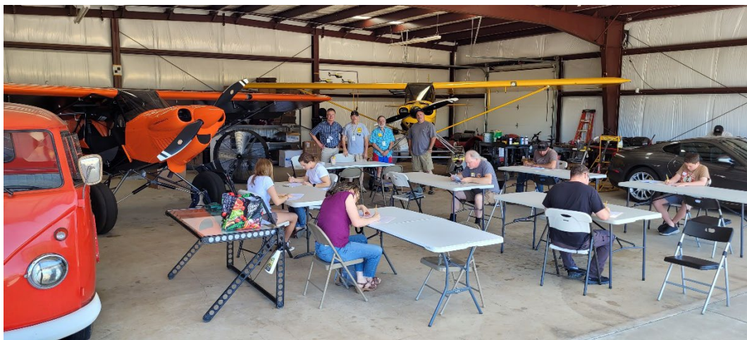
Hangin' around the hangar – what a cool place to take your Amateur Radio exam!!