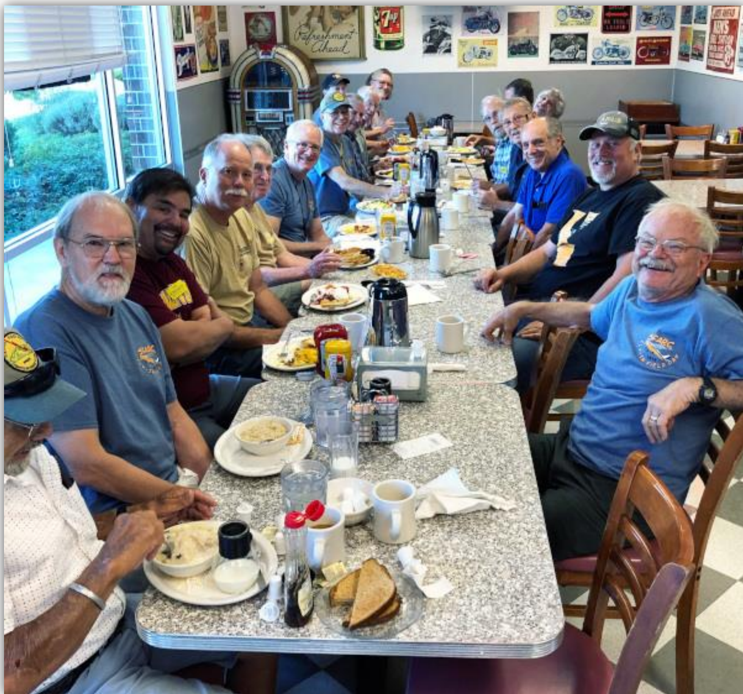
Club breakfast at Mel's Diner Saturday July 27, 2019