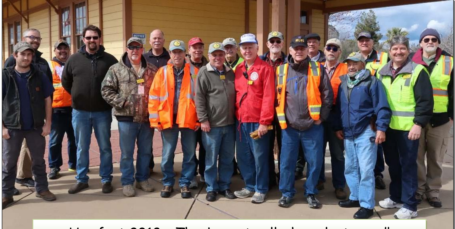
Hamfest 2018 - Thank you to all who volunteered!