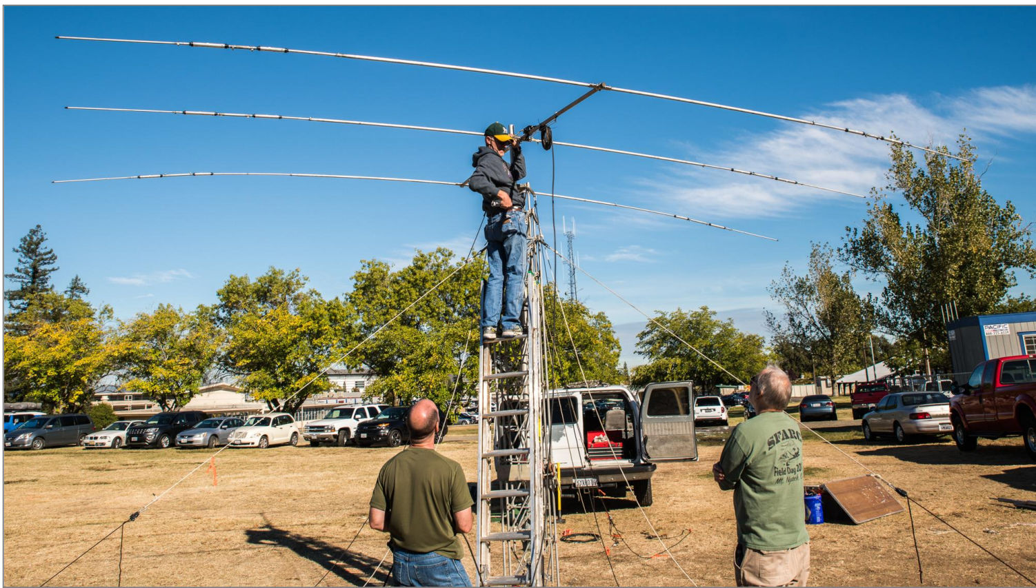
Jamboree On The Air (JOTA) Saturday October 21, 2017