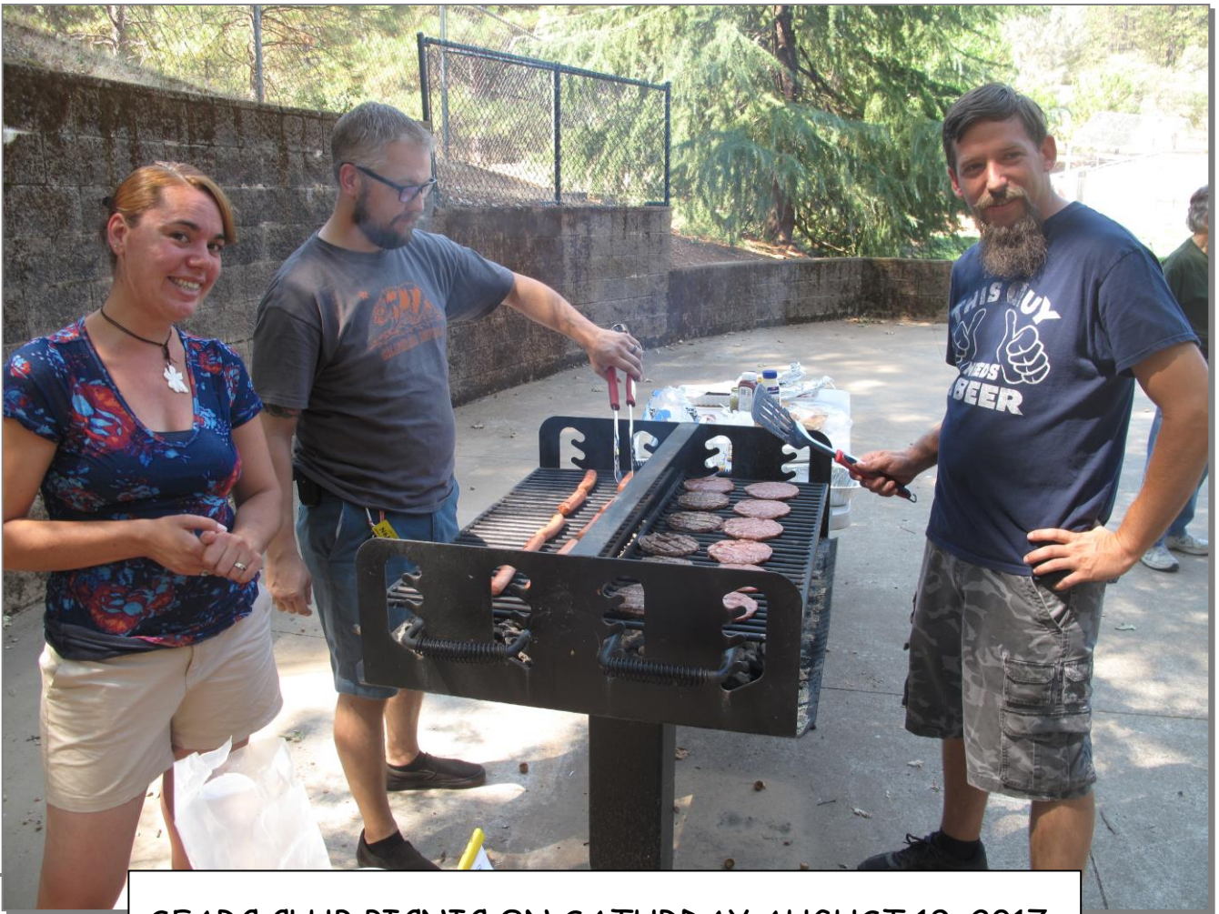
SFARC CLUB PICNIC ON SATURDAY AUGUST 19, 2017