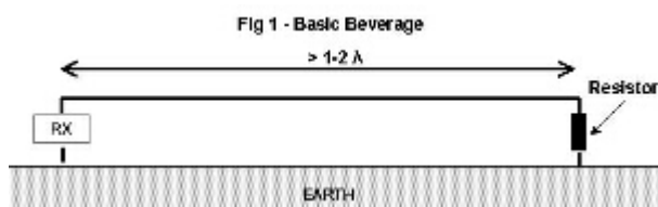
Figure 1 shows the basic unidirectional Beverage. It

comprises a wire, one to several wavelengths long strung a few feet above the ground. The receiver connects between the wire and ground at one end. The other end is terminated in a resistor to ground. The impedance of such an antenna will be in the 400 ohm range, and that's the value for the resistor.