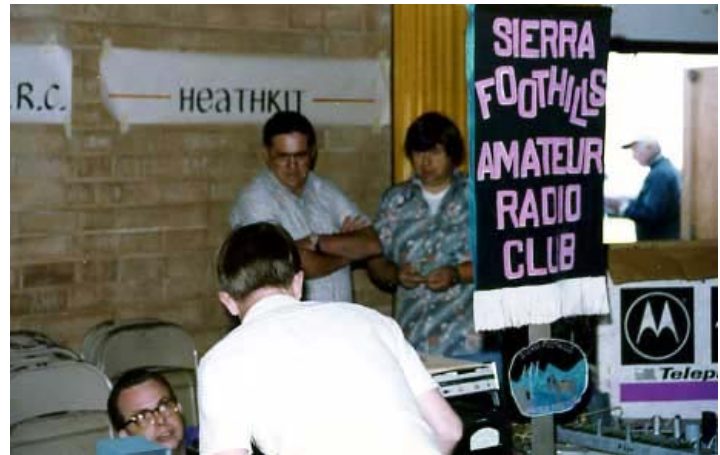
Can anyone tell us about this old photo that Carl Schultz WF6J found?