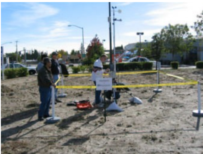
Air Quality Control checking for levels of toxic fumes.