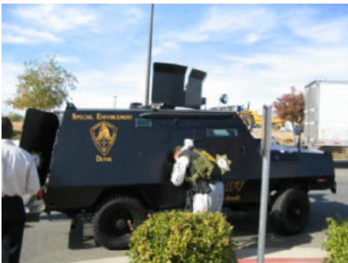
Sacramento Special Enforcement Detail